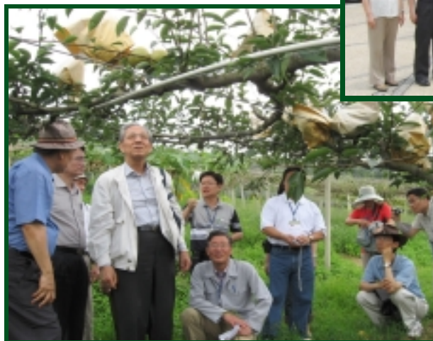
FFTC TAC members and staff visit outstanding and successful agricultural programs and agri-industries in Taiwan. (clockwise) Miaoli District Agricultural Research and Extension Station; Ta-Hu Wine Lodging; Pear grafting farm at Shih-Men.

Toward further improving the Strategic Plan, some of the valuable recommendations from the TAC members include the following: 1) Priority-setting mechanism of missions, topics and activities, in consideration of FFTC's limited financial and human resources; 2) Defining missions and operational strategy in terms of clear and focused activities and outputs beneficial to small-scale farmers in the region; 3) Commitment from all partner countries to provide inputs in terms of urgent concerns significant to the agricultural situation in the region.